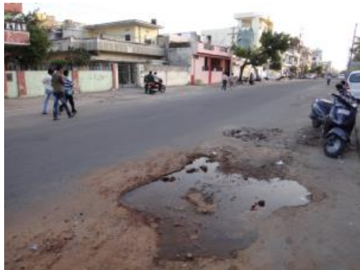
Water leakage on the road