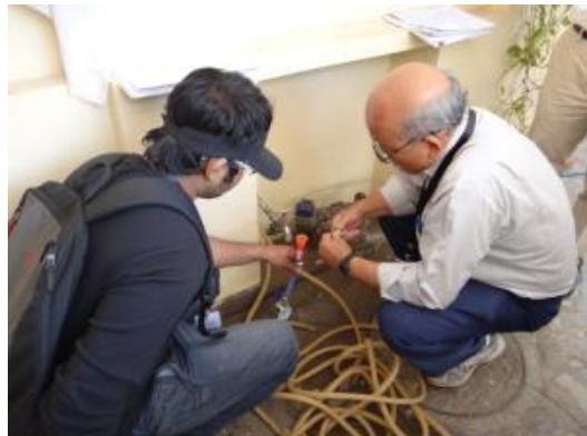
Water pressure survey